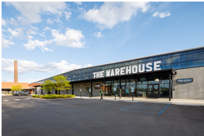
Feed & Seed's Food Hub - located at 701 Easley Bridge Road, Greenville, SC. For more information, please visit their website at www.feedandseedsc.com

PF Meat Co. also partners with a network of farmers to provide local, healthy beef and pork for our communities, so we were in a perfect position to round up large quantities of product to bring to the table.