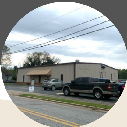
PF Meat Co. Processing Facility

Our PROCESSING facility is located at 305 O'Neal Street, Belton. We transport your animals from our harvest facility to this facility to process and package your orders. When your order is ready, you will pick up your order at this location.