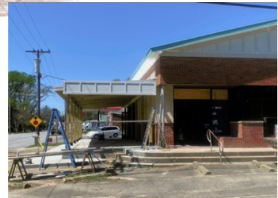
233 E. Main Street Pendleton